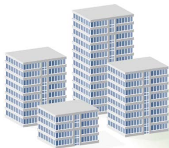
Sitz der Betreibergesellschaft